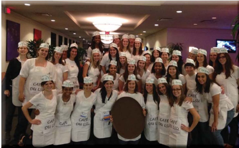
SNA State Convention

On September 22 nd , SNA members sorted clothing,